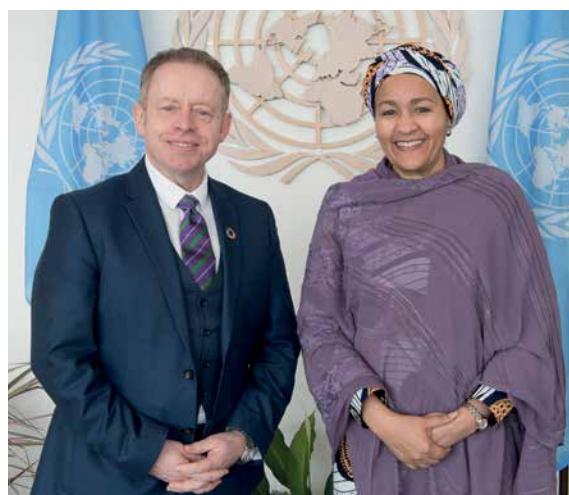
Minister of State for the Diaspora and International Development, Ciarán Cannon T.D., with Deputy Secretary-General of the United Nations, Amina Mohammed. February 2018.