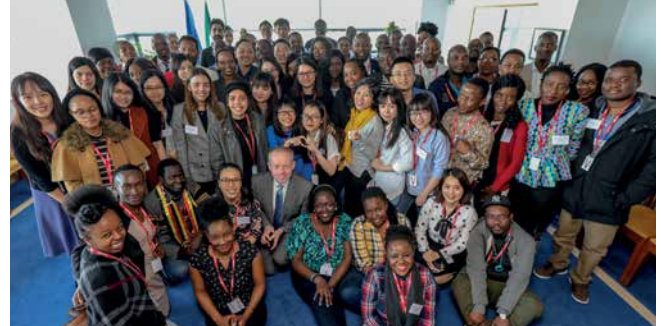
Minister of State for the Diaspora and International Development, Ciarán Cannon T.D., with 2018-19 Irish Aid Fellows in Limerick. April 2019.

To increase the value of two-way trade between Ireland and Africa to at least €5 billion by 2025 and to promote investment, we will: