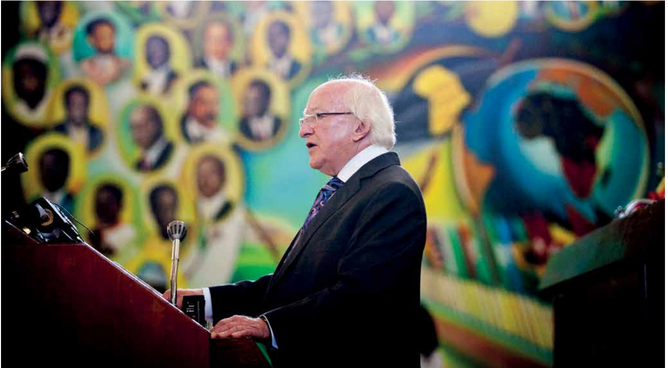
President Michael D. Higgins addressing the United Nations Economic Commission for Africa, Addis Ababa, Ethiopia. November 2014.