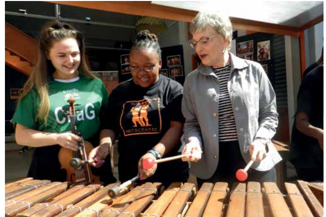
Minister for Children and Youth Affairs, Katherine Zappone T.D., with South African and Irish musicians, visiting Sibikwa Community Arts in Johannesburg to celebrate St. Patrick's Day through South African/Irish musical fusion. March 2019.