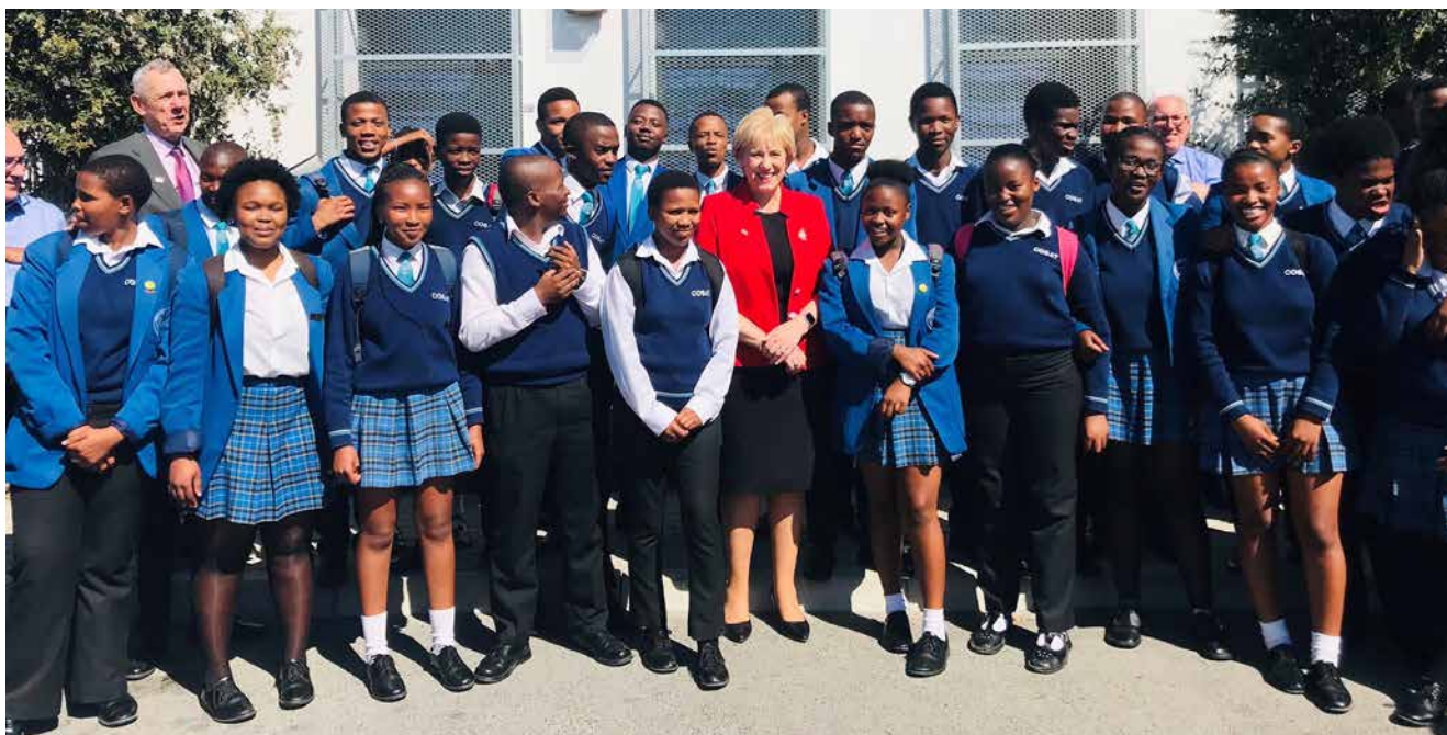
Minister for Business, Enterprise, and Innovation, Heather Humphreys T.D., visiting a science, technology, engineering and mathematics school supported by an Irish organisation, International Computer Driving Licence (ICDL), during a trade mission to South Africa. November 2019.