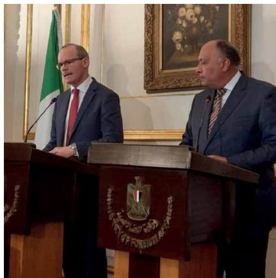
Tánaiste and Minister for Foreign Affairs and Trade, Simon Coveney T.D., with Minister of Foreign Affairs of Egypt, Sameh Shoukry, in Cairo. January 2018.