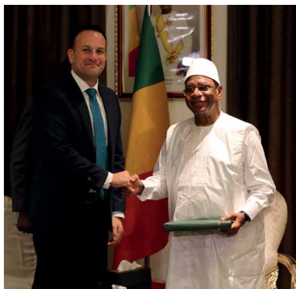
An Taoiseach, Leo Varadkar T.D., meeting with President of Mali, H.E. Ibrahim Boubacar Keita, in Bamako, Mali, January 2019.

Ireland supports strongly a much more ambitious EU approach to Africa. This requires Ireland to be well informed, in particular through an enhanced engagement with African countries so that Ireland can advocate within the EU on issues of interest to them – including as the largest English-speaking country remaining in the EU.