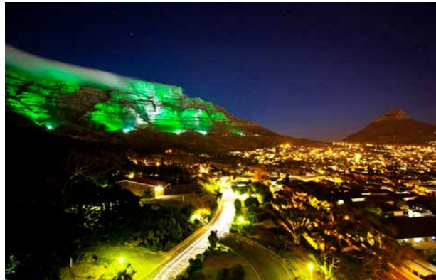
Freetown's Cotton Tree, Victoria Falls, the Great Pyramid of Giza and Cape Town's Table Mountain are some of the African landmarks that have turned green to celebrate St. Patrick's Day.