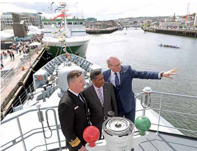
Tánaiste and Minister for Foreign Affairs and Trade, Simon Coveney T.D., with President of the Republic of Seychelles, H.E. Danny Faure, and Chief of Staff of the Defence Forces, Vice Admiral Mark Mellett, at SeaFest - Ireland's National Maritime Festival, Cork. June 2019.

Supporting inclusive economic growth and boosting trade and investment between Ireland and Africa is of benefit to both sides.