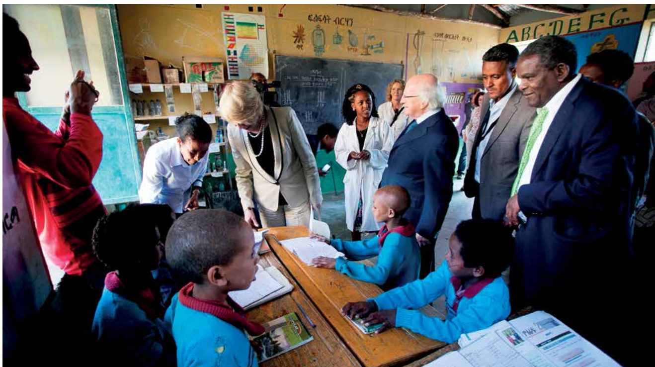
President Michael D. Higgins and Ms Sabina Higgins visiting a classroom in Damayno, Tigray, Ethiopia. November 2014.