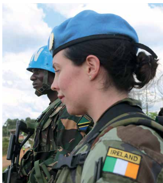
MONUSCO in Democratic Republic of Congo is one of many UN peacekeeping missions where Irish and African peacekeepers have worked together for peace and stability.