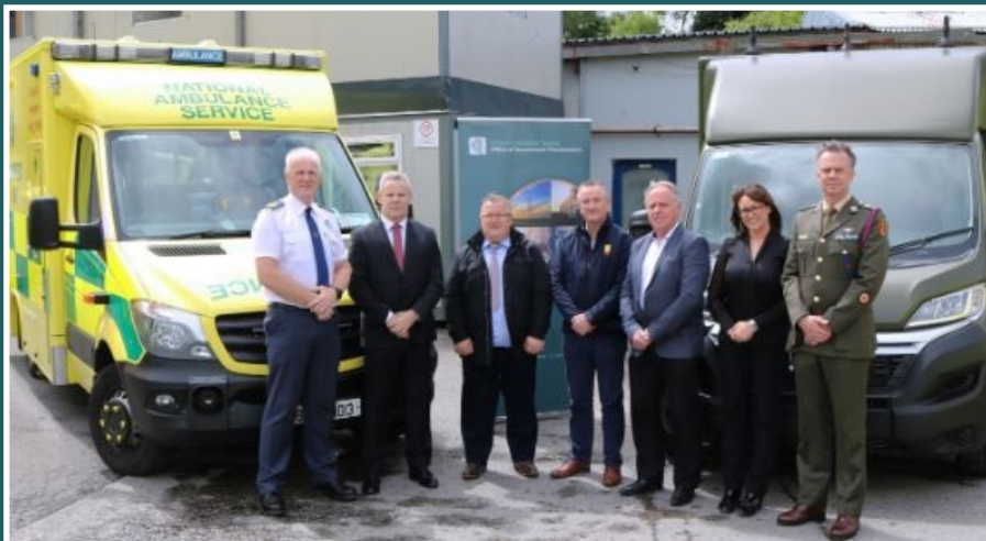
Representatives of the OGP, HSE, and Defence Forces at the Wilker Auto centre, Co. Offaly

This latest framework contract means that most emergency vehicles being purchased in Ireland are also made in Ireland. The OGP's recent framework contract for fire engines is also being supplied by Irish SMEs, Carlow-based High Precision Motor Products, and Sídhéán Teoranta, who work in Spiddal, Co. Galway.