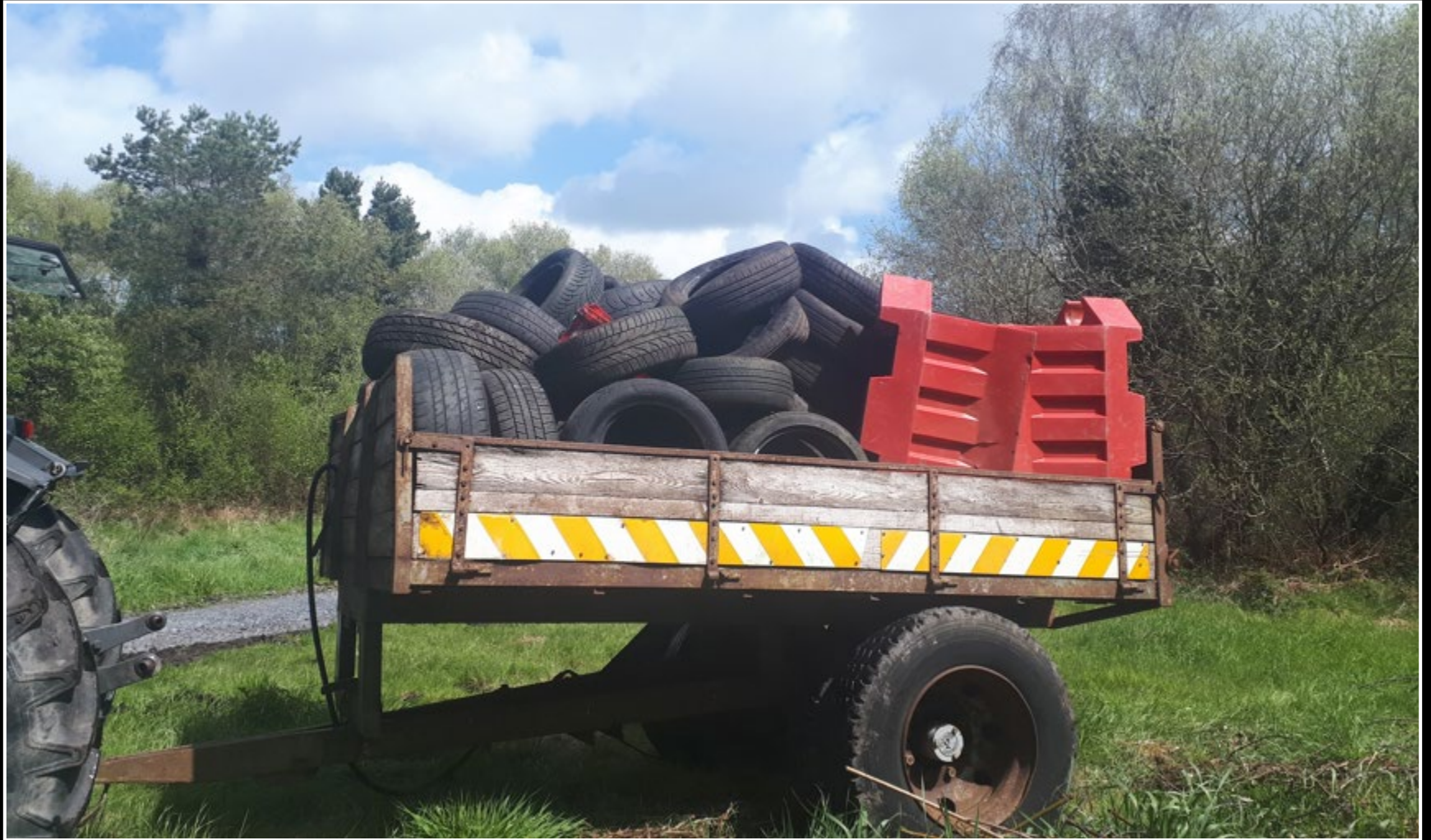
Photographs contd. Removal of waste May 2021