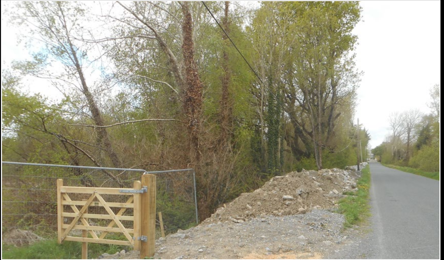
Photographs contd Fill along site of proposed footpath