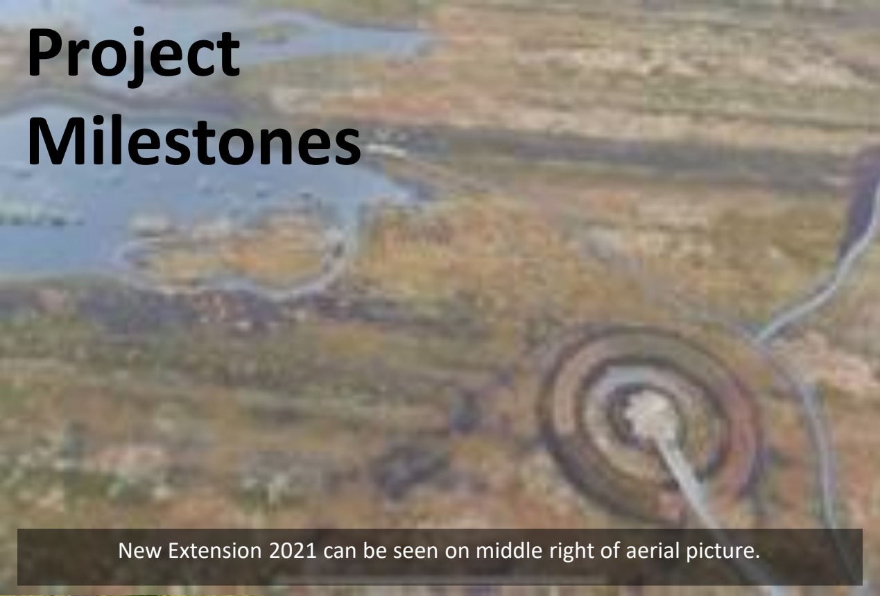
New Extension 2021 can be seen on middle right of aerial picture.