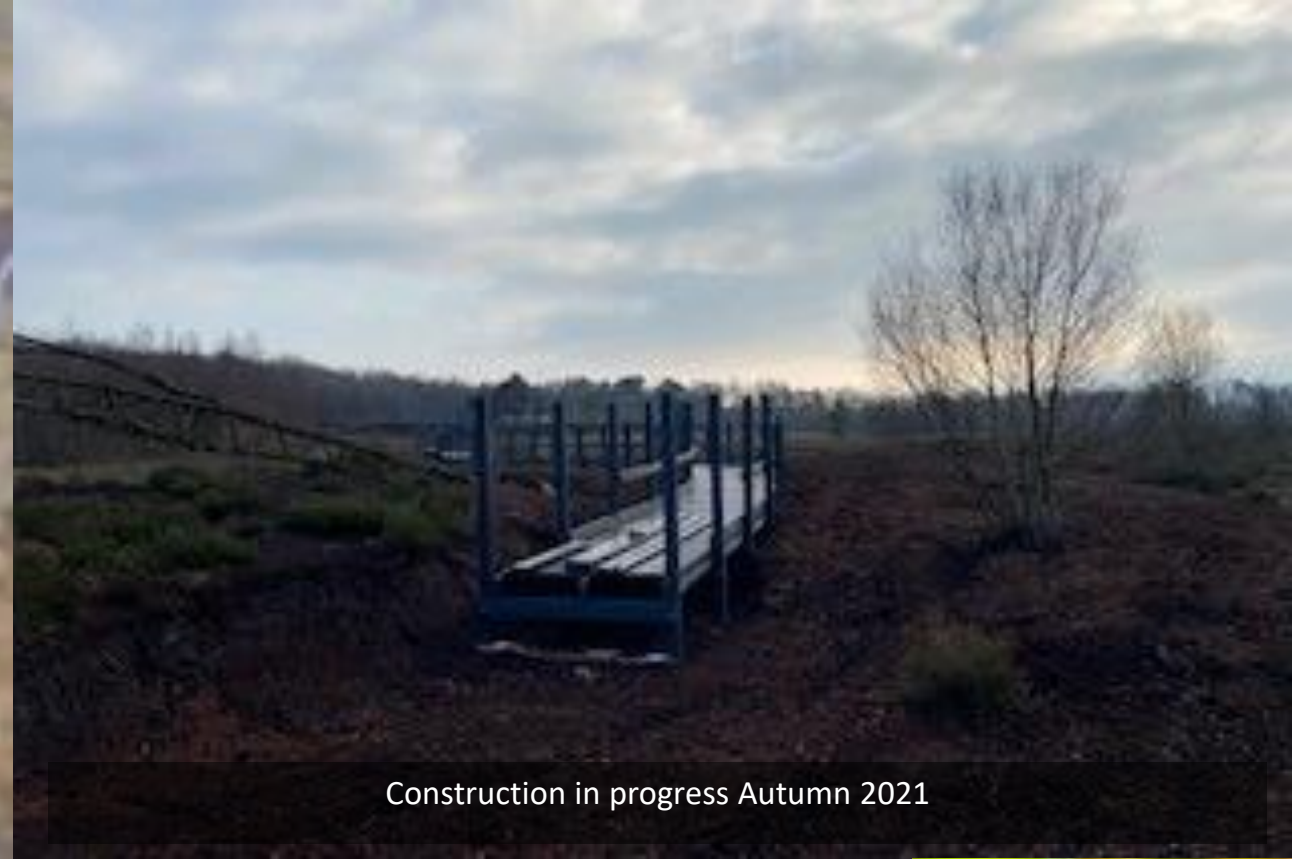
Construction in progress Autumn 2021