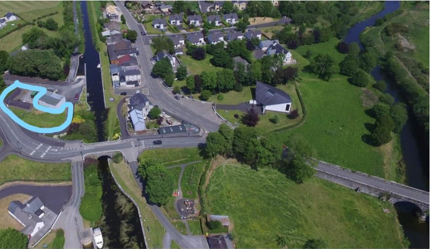
Figure 2. Aerial view of Abbeyshrule. Hub location in blue