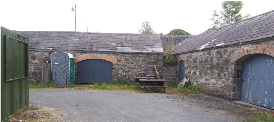
Figure 3. Derelict sheds to be renovated