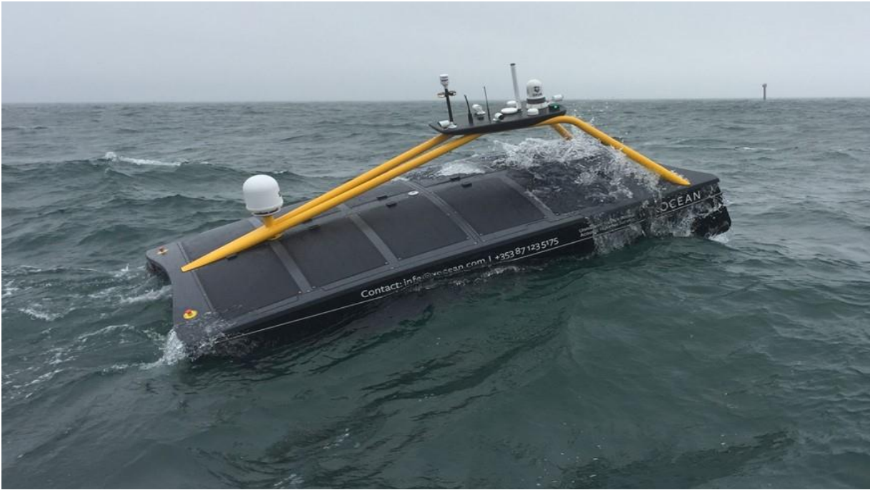
Figure 2: X0-450 USV