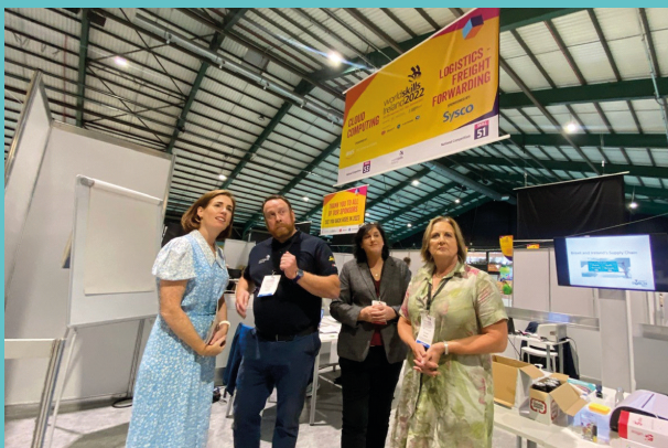
Minister Naughton visiting World Skills Ireland 2022 and meeting with LSCSG members

The LSCSG participated in a number of events throughout 2022 to promote the logistics and supply chain sector. Events attended included Worldskills Ireland – the country’s largest apprenticeship showcase – the Transport Manager Seminar organised by Freight Transport Association Ireland (FTAI) and an Apprenticeship Careers Showcase organised by Limerick Clare Education and Training Board (ETB).