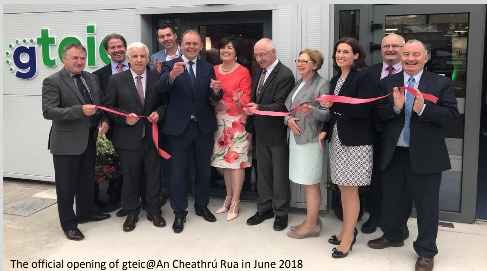
The official opening of gteic @An Cheathrú Rua in June 2018

These developments will give the Gaeltacht community, both at home and abroad, an opportunity to return to or live in their home area by providing remote working opportunities at hot desks, co-working spaces or private offices at these hubs. This in turn will support, bolster and assist these unique language communities and help them to face the challenges of rural depopulation.