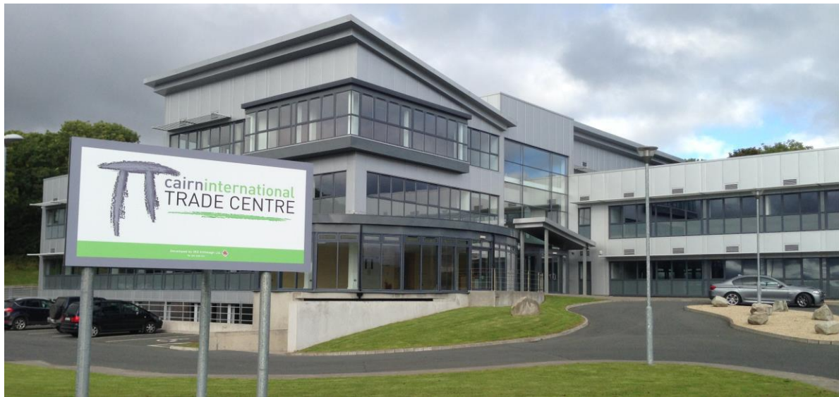
Cairn International Trade Centre, Kiltimagh

In terms of an output from all of this activity, employment figures are as follows: