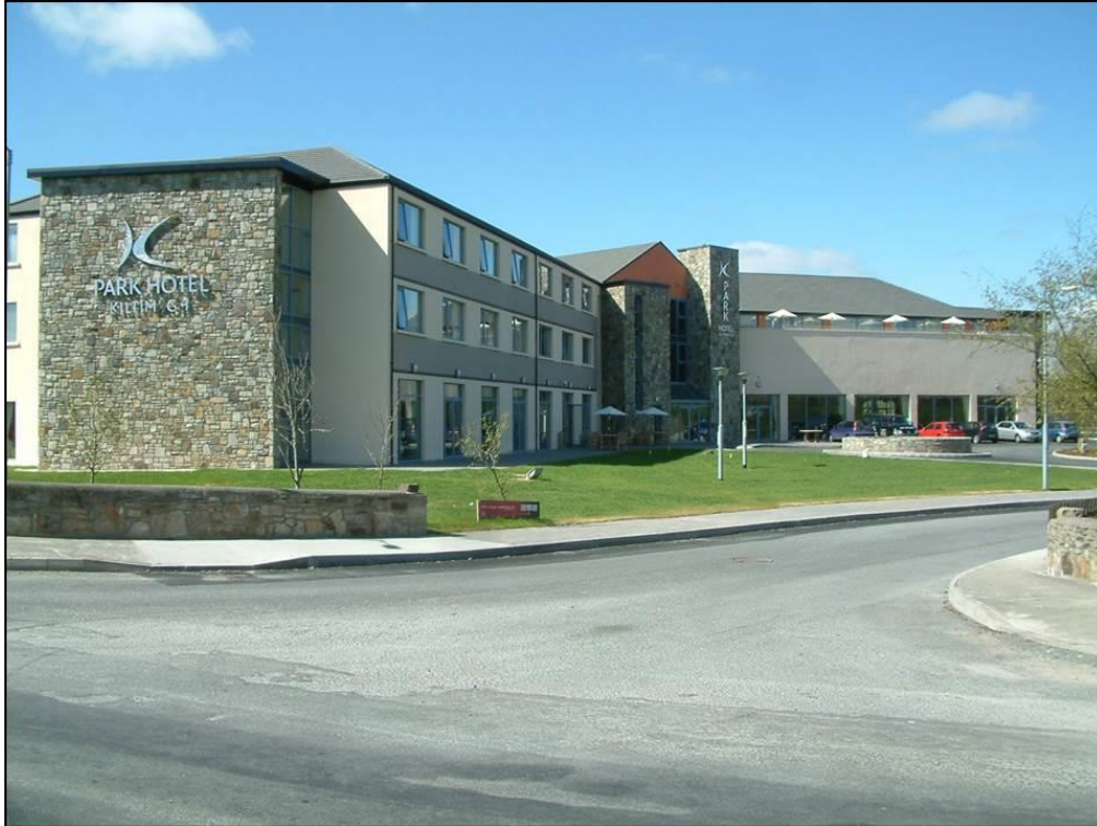
Park Hotel, Kiltimagh.

Our town is lucky to have the benefit of two top class hotels with about 70 bedrooms and this is also largely due to the presence of the Airport. Between them, the hotels would give employment to about 65 people locally.