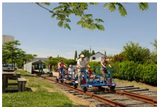
Example of a Velorail Project in operation

We also have current plans (in partnership with Mayo County Council) to develop a unique Velorail Tourism project of the currently disused Western Rail Corridor. We project that this project could attract somewhere of the order of 30,000 visitors per year and we see the Airport as a critical piece of the infrastructure underpinning this project. This project will in itself create about 4 jobs but will contribute greatly to the sustainability of existing jobs in the hospitality sector locally and help extend the tourist season for both local hotels.