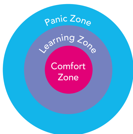
Figure 2: Senninger’s Learning Zone