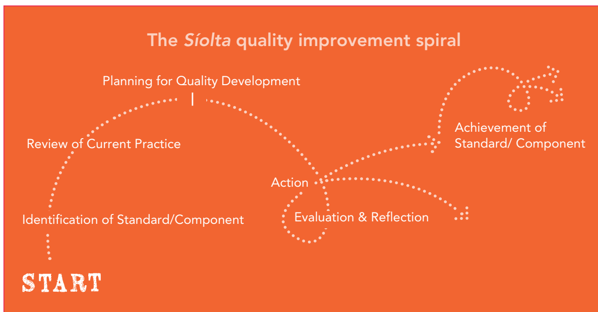
Figure 1: Síolta Quality Improvement Spiral