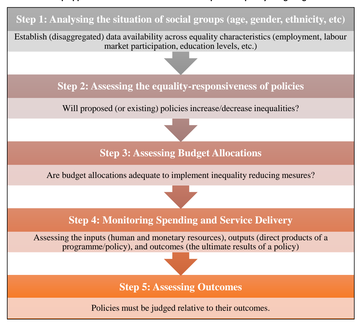
Box 2: Five-Step approach of Budlender and Hewitt adapter to equality budgeting

The five-step approach laid out by Budlender and Hewitt<sup>910</sup> is also a widely cited framework used to approach gender budgeting. The five steps (adapted for application to equality budgeting) are outlined below.