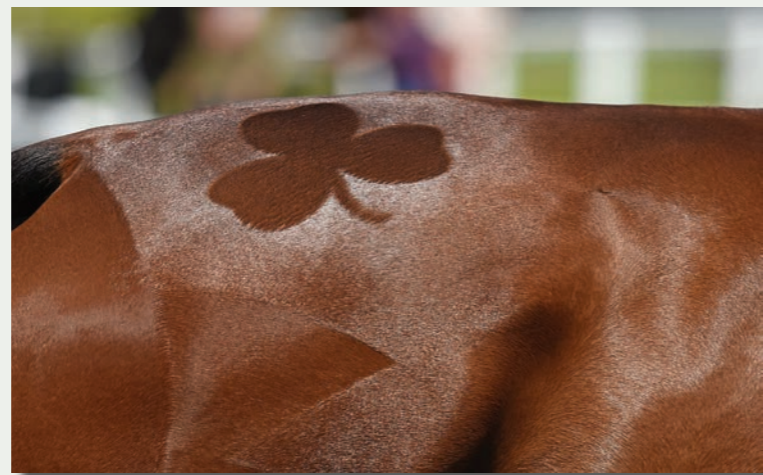
Table 1.4 - The Irish Horse Register: Foals Registered in 2013

A significant percentage of horses registered in the Irish Sport Horse Studbook now have genetics which originated in foreign studbooks and the majority of top show jumping horses competing nationally and globally have continental genetics.