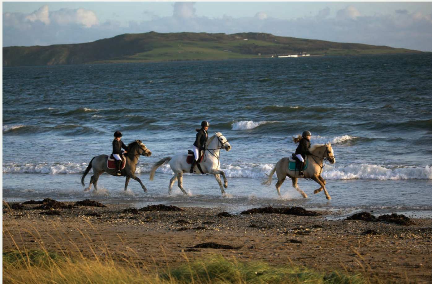
In 2012, overseas visitors, who engaged in equestrian activities while in Ireland, spent an estimated €79 million