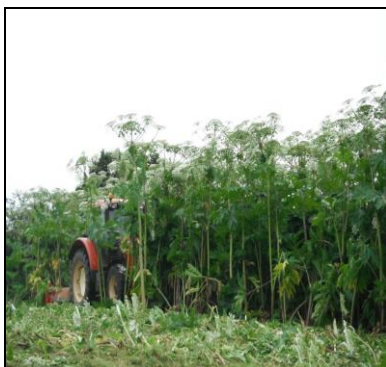
Fig. 1: Invading agricultural land

Giant hogweed ( Heracleum mantegazzianum ) is an invasive biennial or perennial plant species which is native to the Caucasus Mountains at the border of Europe and Asia. It was introduced to Ireland in the 19 th Century as an ornamental garden plant. Since then, it has escaped into the wild and is scattered throughout the country. Giant hogweed grows best in rich, moist soil and is commonly found along streams, ditches, roadsides and wet meadows. Please see link to its distribution across Ireland: http://maps.biodiversityireland.ie/#/Home .