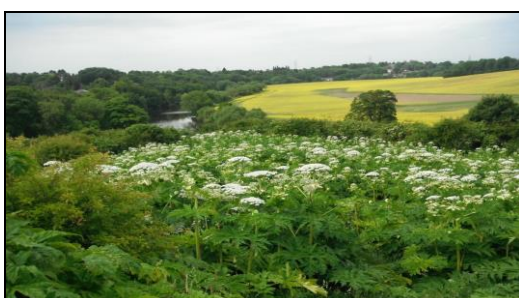
Fig. 4: Giant hogweed infestation

Giant hogweed is considered to be a significant danger to public health. The stems, edges and undersides of the leaves are coated with fine hairs containing phototoxic sap. The slightest contact with human skin can cause severe dermatitis in the presence of sunlight. Effects may include welts, rashes, and blistering. The sap can also cause temporary or permanent blindness following contact with eyes. If skin comes into contact with Giant hogweed the affected area should be covered immediately from sunlight. The skin should then be washed with cold water and medical advice should be sought as soon as possible. Giant hogweed can invade farm and forestry land, reducing available agricultural area and biodiversity (See Fig. 1 & Fig. 4). Animals grazing Giant hogweed may be susceptible to poisoning or digestive disorders. Ingestion of Giant hogweed has been found to interfere with the fertility of female livestock.