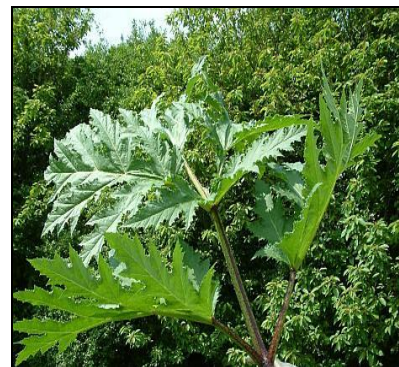
Fig. 3: Giant hogweed leaves