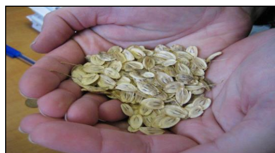
Fig. 5: Giant hogweed seeds (www.nonnativespecies.org)