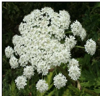
Fig. 2: Umbrella-shaped flower heads (www.bioimages.org.uk)