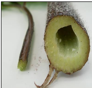
Fig. 7: Hollow stem