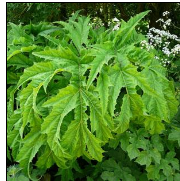
Fig. 8: Jagged Giant hogweed foliage