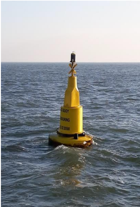
Example of buoy at locations A and D1 FL Y (5) 20 s