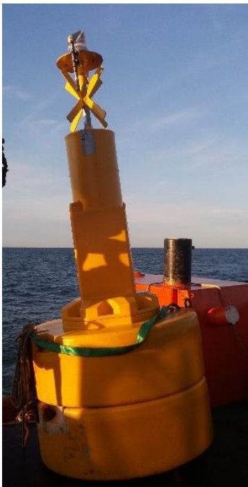
Example of buoy at location B1 and E FL Y (5) 20 s