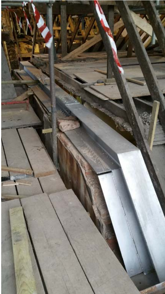
Steel inserted in rear gable of no. 17