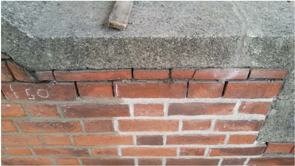
Temporary lime mortar pointing on brick parapet (no. 14)