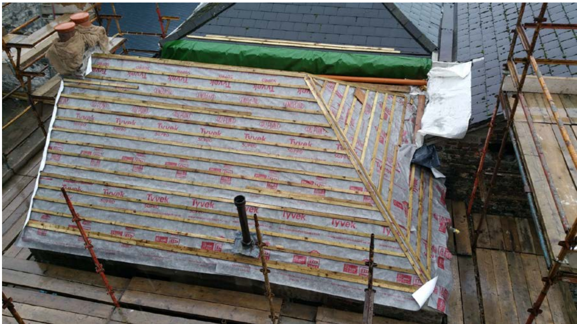
Roof at rear of no. 14, ready for slating