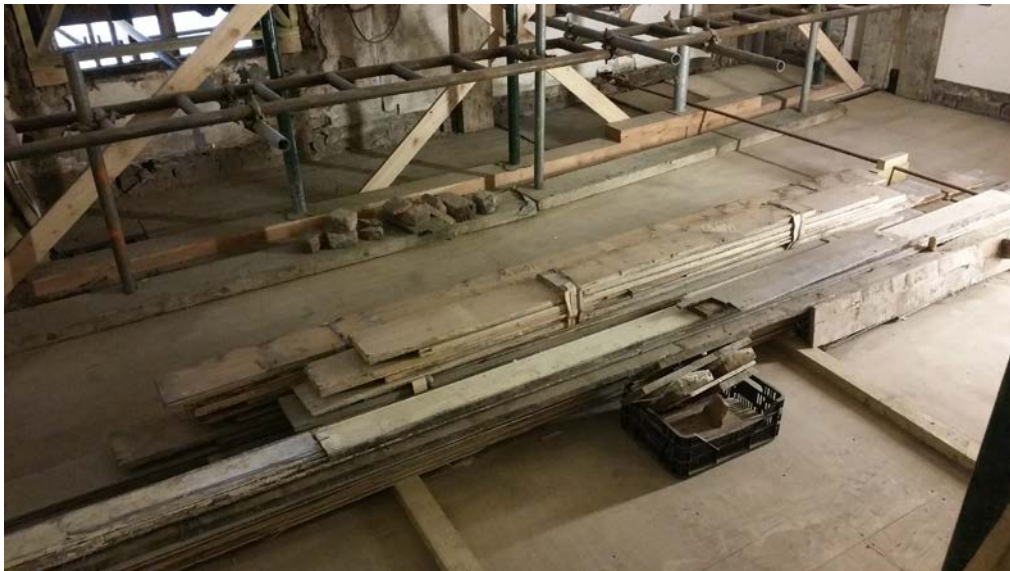
Timbers belonging to front room of no. 16, returned for storage