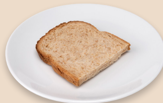
1/2-1 slice bread