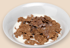
1/2 cup (30g) flaked cereal fortified with iron

Each of these examples shows one serving