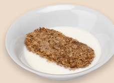
1-1 1/2 wheat biscuits