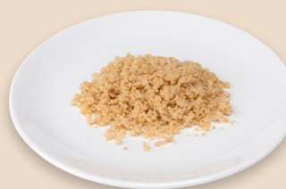
1/2 cup (30-40g) cooked rice