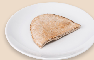
1/2 pitta pocket