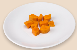
1/2 cup (30-40g) cooked sweet potato or yam