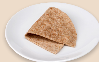
1/2 small wrap