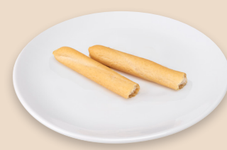
1 unsalted breadstick