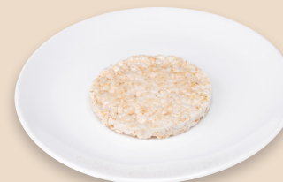
1 plain rice cake