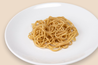
1/2 cup (30-40g) cooked noodles