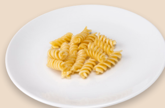
1/2 cup (30-40g) cooked pasta