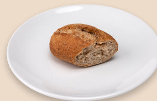
1/2-1 small roll