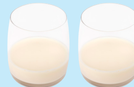
200ml or 2x100ml unsweetened soya 'milk' fortified with calcium