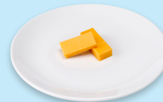
2 adult thumbs of cheese