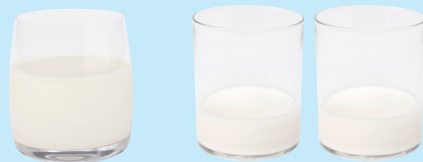
200ml or 2x100ml plain milk or milk with added vitamins

Each of these examples shows one serving