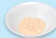
Homemade custard or rice pudding made with 200ml of milk

Servings can be split during the day between a meal and a snack. 1 serving can combine two foods or drinks. For example, 1 serving could be 100ml of milk with 1 small pot fromage frais or 1 thumb of cheese.