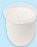
1 pot (125g) plain yogurt