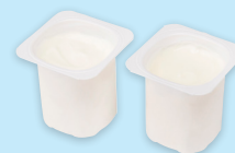
2 small pots (47g) plain or natural fromage frais