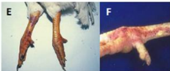
E & F: Blue discoloration of shanks