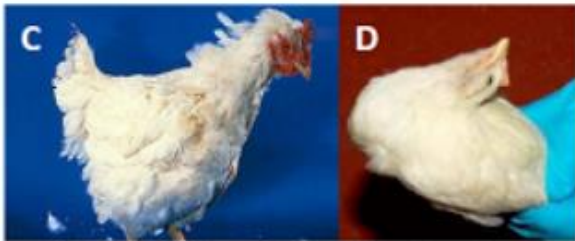
C: Ruffled feathers. D: Twisting of head and neck